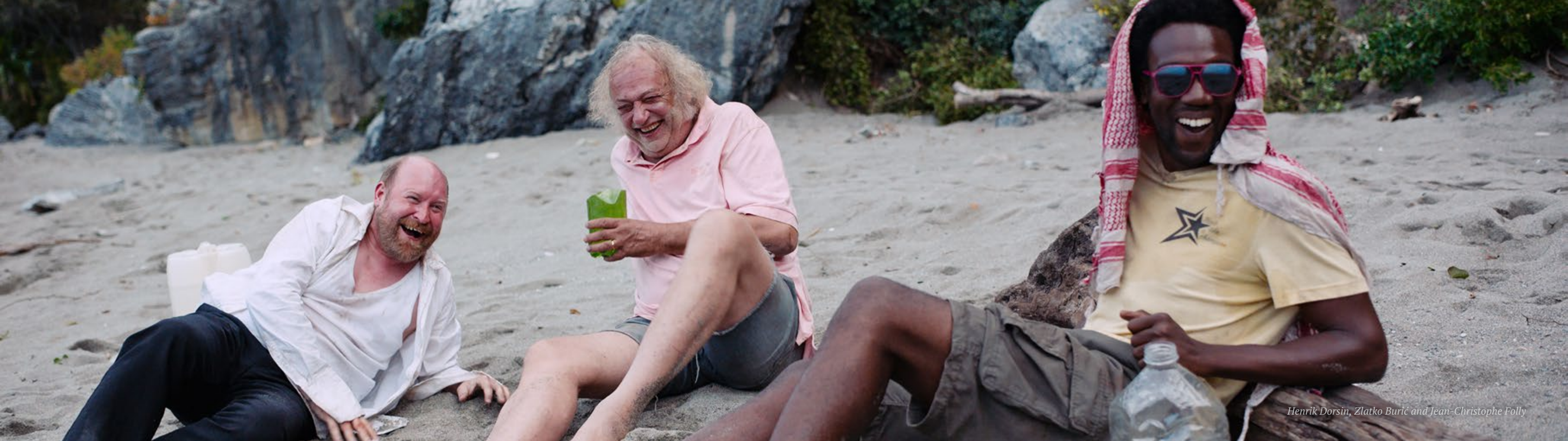
Henrik Dorsin, Zlatko Burić and Jean-Christophe Folly